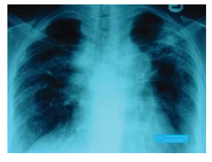
Figure 4. CXR after steroid therapy. Discussion

A diagnosis of pulmonary sarcoidosis presenting as AIHA was established and the patient took oral prednisolone (60 mg per day). Of note, she required a blood transfusion due to a further drop of her hemoglobin. Steroids were tapered after six weeks, by 10 mg every two weeks until a dose of 40 mg was reached. The patient maintained that dose for almost a year before it was tapered slowly. She has been off steroids for at least four years and clinically remains asymptomatic. Her last hemoglobin was 135 gm/dL with a normal reticulocyte count and negative Coombs test. Follow up pulmonary functions showed marginal improvement with 8% increase in flow and increased transfer factor. Chest X-ray showed some improvement (Figure 4).