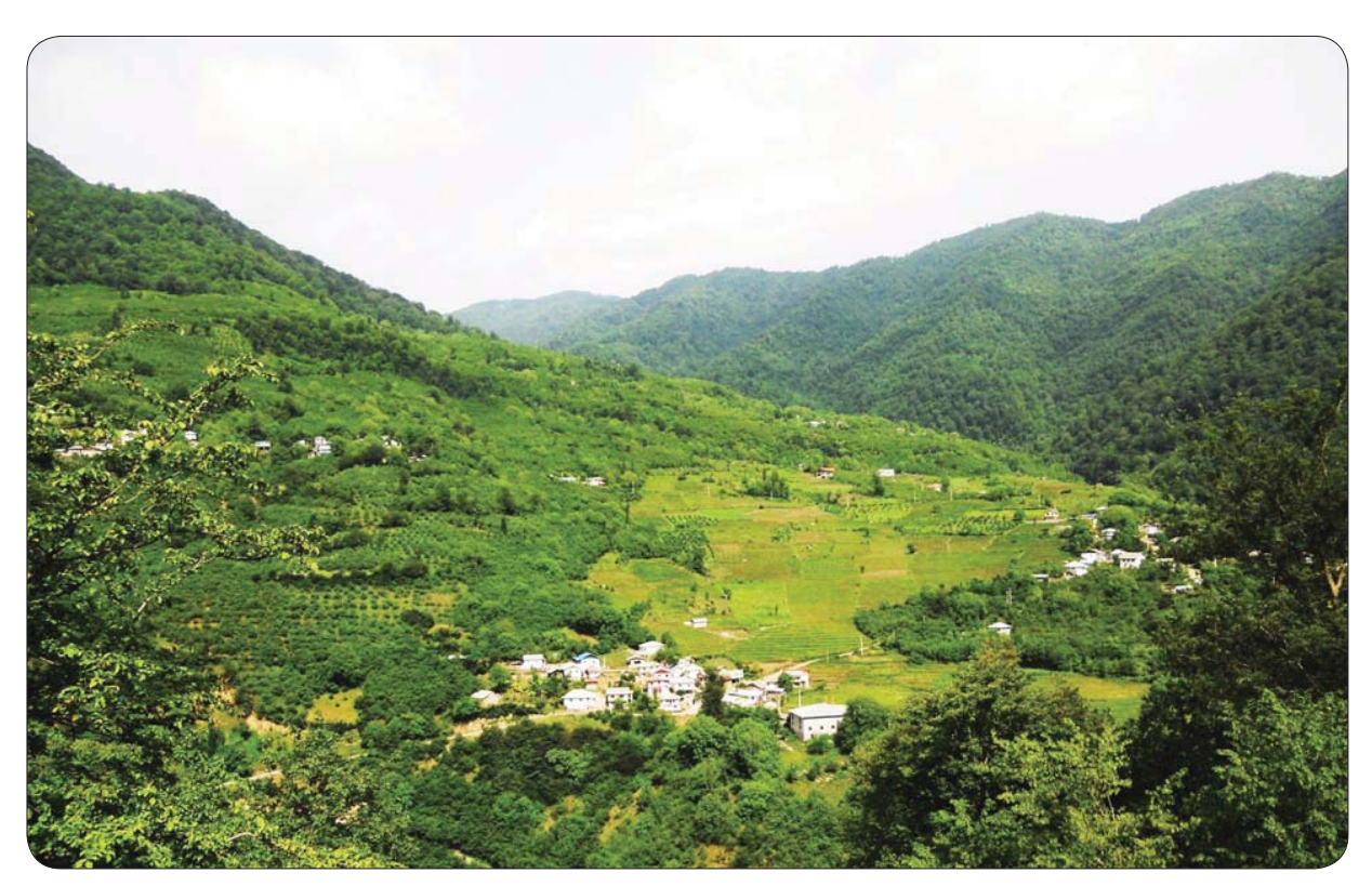
A view of Chaboksar, along the Caspian Sea, Gilan Province, Iran