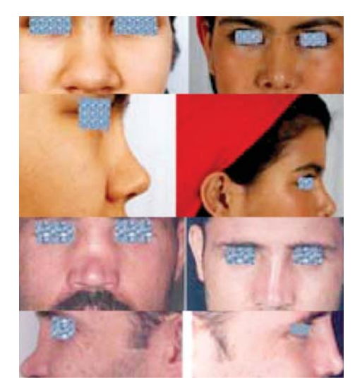
Figure 2. Pre- and postoperative views of two patients.

Figure 2 shows the preoperative pictures and postoperative results of 2 patients.