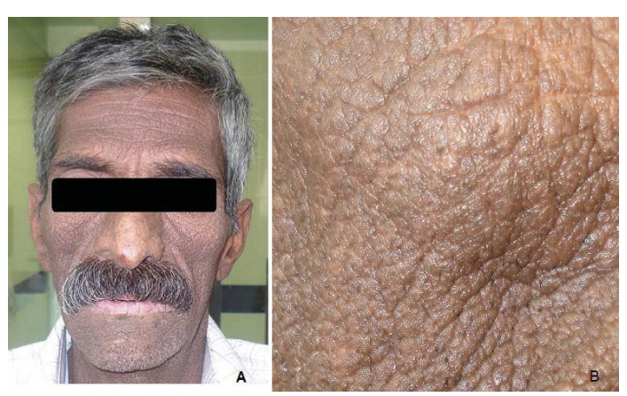
Figure 1. Generalized pigmentation (A) Head and neck; (B) closed view.