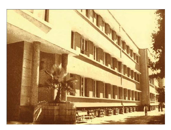
A view of Shiraz School of Medicine in the 1970s.