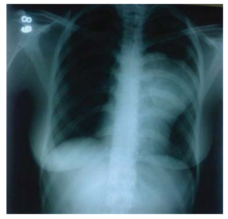
Figure 1. PA chest radiography prior to treatment.