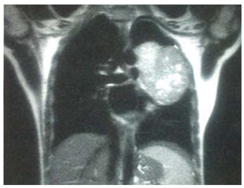
Figure 3. Thorax MRI prior to treatment.