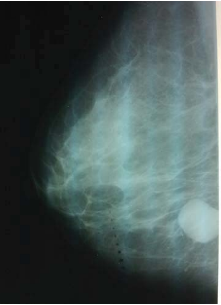
Figure 1. Mammography of the breast mass.