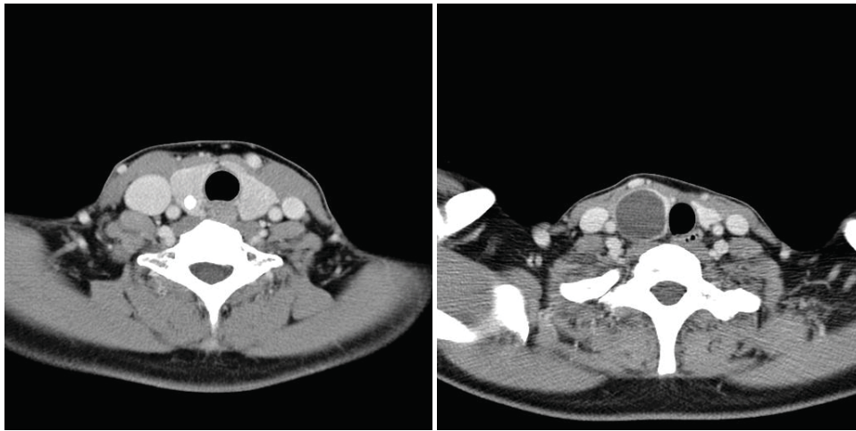
Figure 1. A) Computed tomographic image shows a 0.7 cm sized calcified nodule with no extrathyroidal extension and no lymph node metastasis in patient 1. B) In patient 2, the computed tomographic image shows a 3 × 3 cm-sized homogenous cystic nodule in the right thyroid gland.