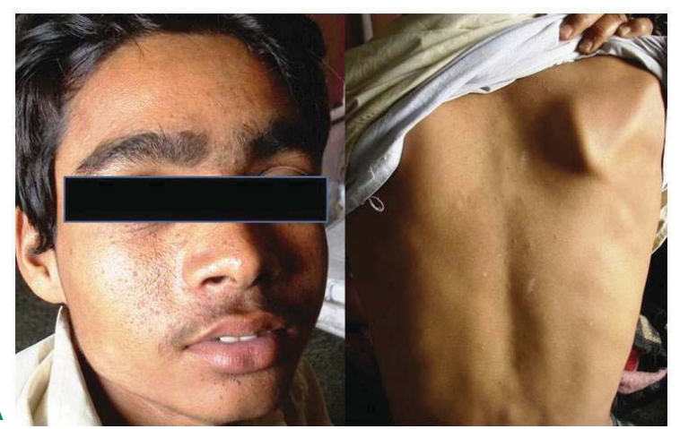
Figure 1 (A and B). Facial lesions and a hypopigmented spot on the patient's back.