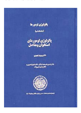
Figure 3. "Pathology of Tumors of the Bones and Joints" written by Professor Dabiri.

Pathology of Tumors (40 volumes), of which 6 volumes including pathology of tumors of the lungs, prostate, bladder, thyroid, kidneys, bones and joints have been published (Figure 3). Congenital Disorders of the Heart, 1958 (Figure 4). A Practical Guide of Pathology for Medical Students.