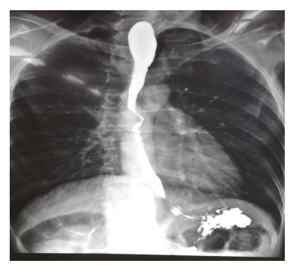
Figure 1. Barium swallow shows narrowing in mid part of the esophagus