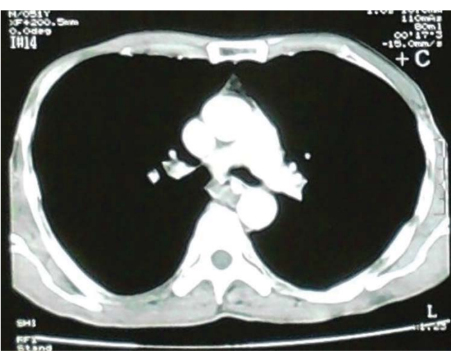
Figure 2. CT scan of the chest shows narrowing of the esophageal lumen