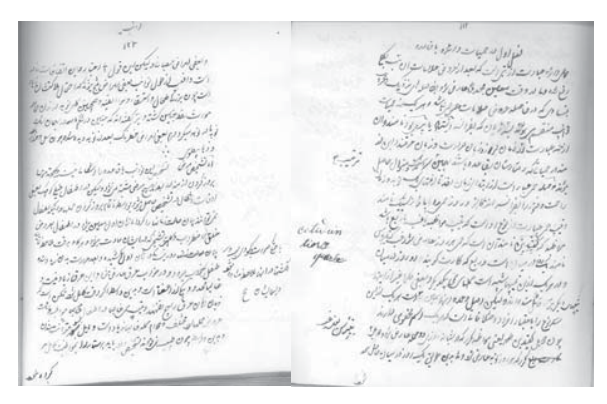
Figure 2. A Persian pathology manuscript written in 1858 discussed various types of fevers and malaria.

Based on historical evidence, during the time of Shah Abbas, a ruler of Safavid dynasty (1587-1629 C.E.), there were approximately 100,000 Armenians that migrated to Northern Iran. Shortly thereafter 20,000 people died of malaria and the survivors transferred to Isfahan, the capital city.<sup>29</sup> Subsequently, during the Qajar period (1796-1925) malaria was a major health problem. It was an endemic disease, particularly along the Caspian Sea in Gilan, Mazandaran and Gorgan Provinces; additionally it was common in Khorasan, Azarbiajan, Kurdestan, Kermanshah, Hamadan, and Khuzestan Provinces. The Persian Gulf territories were highly affected. During that time, the main reasons for malaria, particularly in Iranian villages, were lack of adequate sanitation and presence of stagnant waters which were conducive to breeding the Anopheles mosquitoes. In certain areas, Anopheles mosquitoes were so common that it led to unwanted migration of people who lived in those areas.<sup>30</sup> In 1924, malaria killed 2,634 people in Tehran.<sup>31</sup> Between 1949 and 1953, around half of the workers who were constructing the roads or industrial factories in Northern Iran died from malaria.29