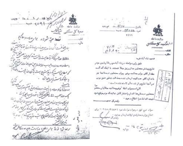
Figure 3. Left) A letter from the Sehhyeh-e Koll-e Mamlekati (Public Health Administration) regarding distribution of quinine tablets among the students who resided in Shahriar, Karaj, near Tehran during 1934. Right) Another letter from the Public Health Administration that described an outbreak of malaria in Shah Abad Gharb, Kermanshah Province in Western Iran during1935.

Prior to the second world war, the campaign against malaria In Iran was limited and mainly focused on the distribution of quinine tablets (Figure 3), petrol products for spraying stagnant waters, and the promotion of some environmental standards on a restricted scale. However, because of the lack of facilities, budget shortage, lack of expertise and WWII, these measures were ultimately stopped.<sup>33</sup>