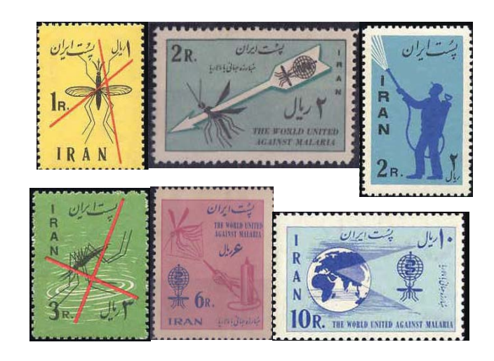
Figure 4. Stamps issued in Iran between 1960 and 1968 regarding the malaria campaign. 41

Between 1964 and 1965, indoor DDT spraying of 43,896 villages with a population of 878, 414 was performed. In 702 villages with a total population of 298,497 resistance to malaria appeared, therefore malathion spraying was used.<sup>38</sup> In 1960s, several stamps were issued to support the malaria campaign in Iran (Figure 4).<sup>41</sup>