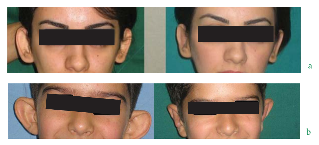
Figure 2. a) Pre- and 18 months post-operative photos in a 23-year-old female. b) Severe bilateral lop ear deformity in an eight-year-old boy. Antero-posterior view, pre- and 14 month post-operative photos.