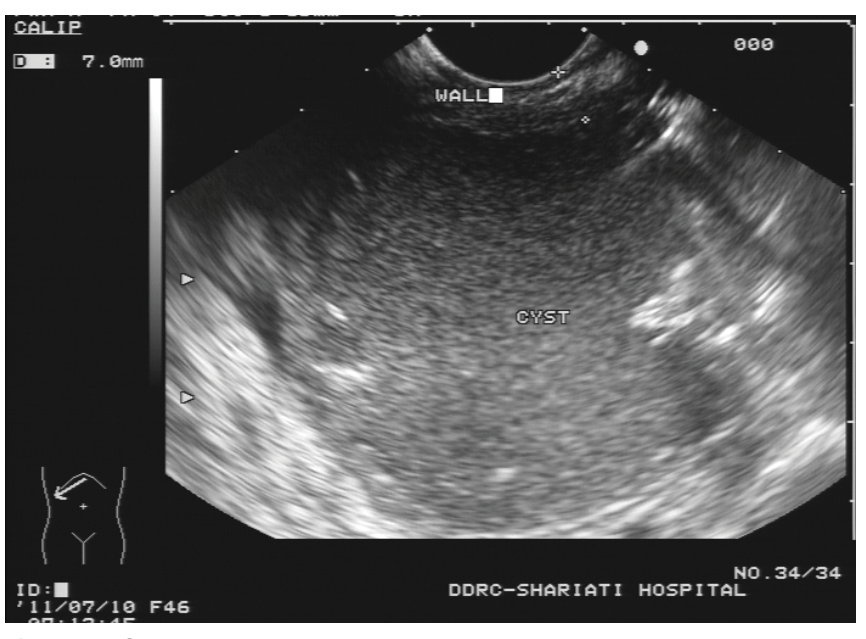
Figure 1. EUS appearance in a patient with a large pseudocyst in the pancreatic head. The cyst contains debris. The cyst was drained through EUS-guided cyst-duodenostomy.

MCN = mucinous cystic neoplasm; IPMN = intraductal papillary mucinous neoplasm; SCN = serous cystadenoma; SPN = solid pseudopapillary neoplasm; NET = neuroendocrine tumor; PD = pancreatic duct; MD-IPMN = main duct IPMN; NA = not available; INET is usually solid with a well defined margin, however, it can be cystic in 10% of the cases (Reference 35); *Reference 36; *Reference 37; £Reference 38; †Reference 40.