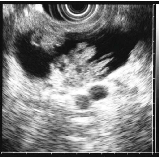
Figure 3. EUS features of main duct intraductal papillary mucinous neoplasm (IPMN) of the pancreas. Note the ecstatic dilation of the main pancreatic duct which harbors multiple mural nodules.