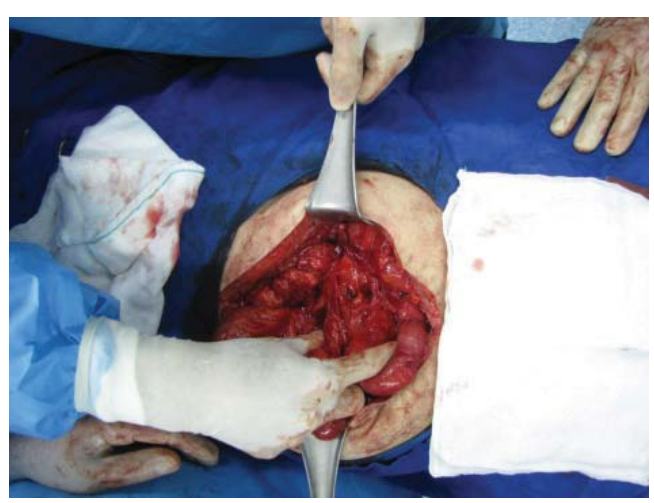
Figure 2. Surgical procedure to release adhesions.