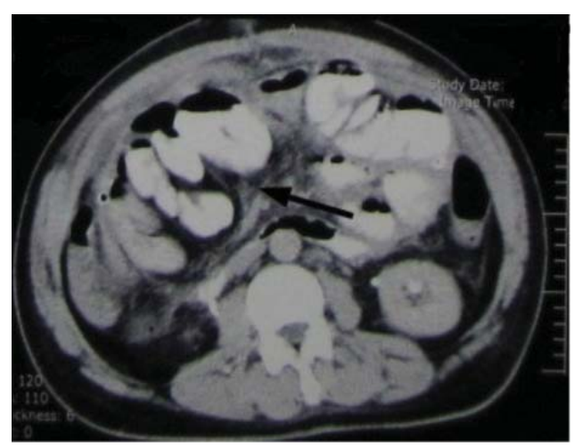
Figure 1. Abdominal Computed Tomography (CT) scan, the arrow shows aggregation of the small bowel loops with increased density of the surrounding mesentery.