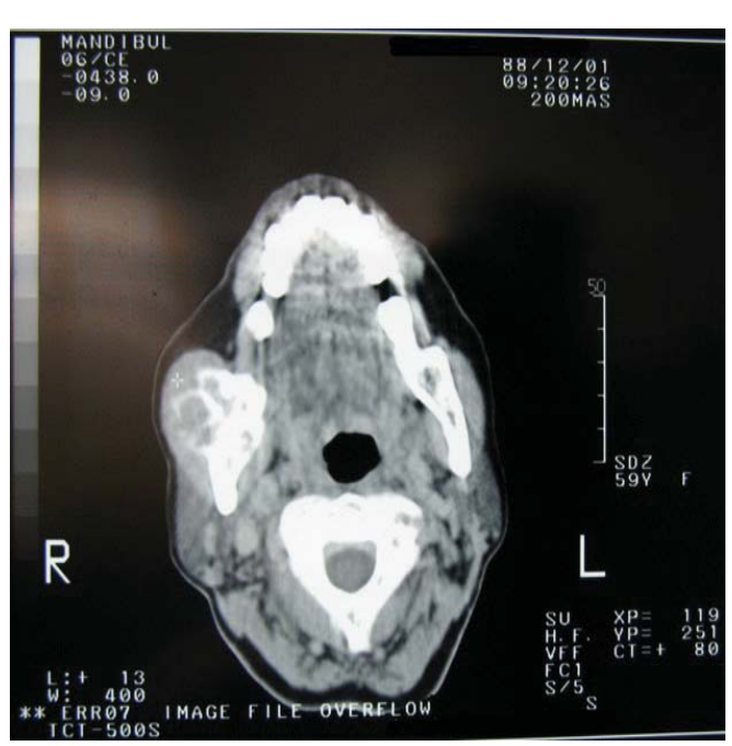
Figure 2. Cortical expansion by the metastatic follicular thyroid carcinoma.