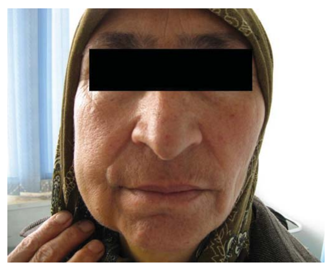
Figure 1. A swelling over the right angle of the mandible on observation.