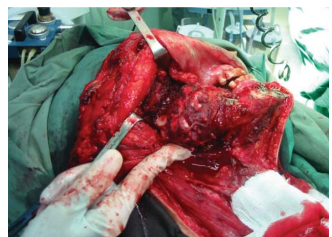
Figure 4. Madibular involvement by the follicular thyroid carcinoma.

an undiscovered disseminated malignancy.10