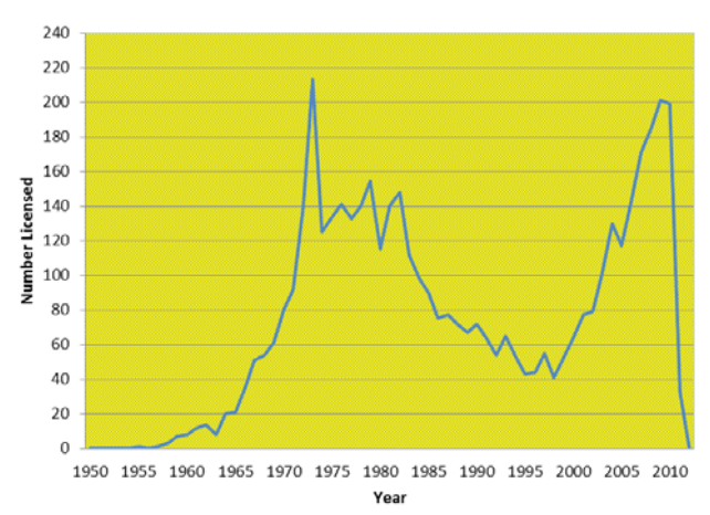
Figure 2. Number of Iranian medical graduates licensed in the United states 1950 – 2010.

tem of Western countries with a difference that basic medical care is available to the majority of the people. The program of village health workers was initiated in Shiraz University in 1971. This program was greatly expanded post-revolution, to the extent that the authorities in the state of Mississippi have consulted the Iranian rural health planners at Shiraz University for planning health in rural communities of Mississippi state. 9