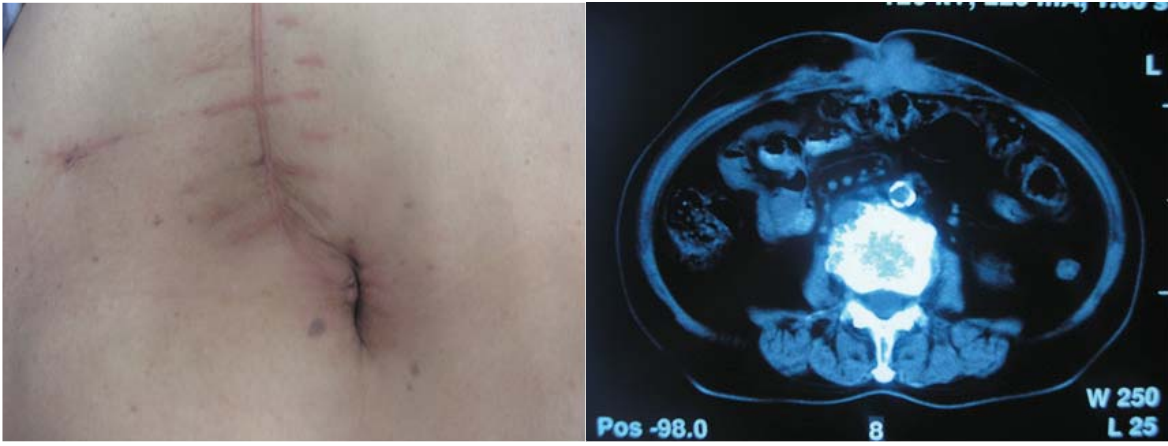
Figure 1. Port-site recurrences of the UGC.