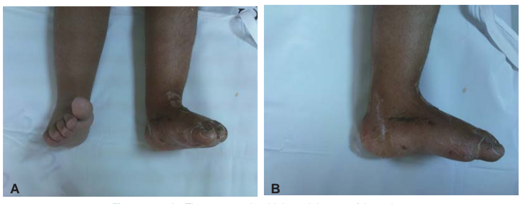
Figures 3. a, b . The postoperative third month images of the patient.