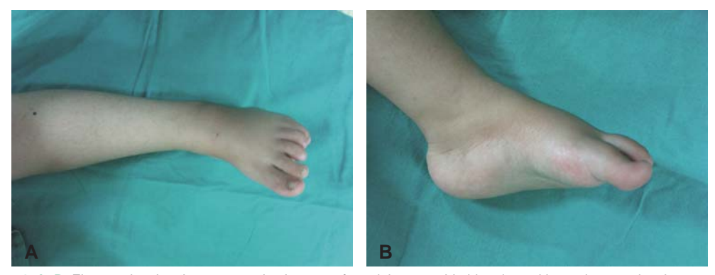
Figures 1. A, B. Figures showing the preoperative images of an eight-year-old girl patient with meningomyelocele sequelae.