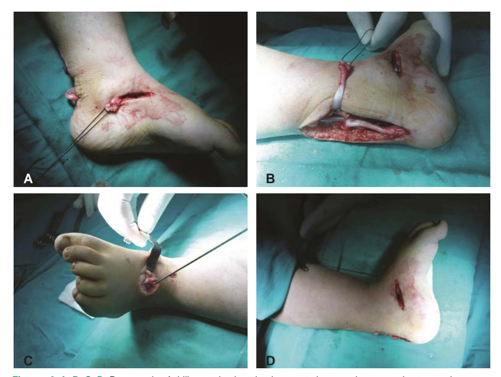
Figures 2. A, B, C, D. Peroperative Achilles tendon lengthening, posterior capsulotomy, and extramembranous transfer of the posterior tibial tendon to the lateral cuneiform bone.

Prior to the operation, active and passive movements of the ankle were measured in the supine position during knee extension. Voluntary and independent contraction of the tibialis posterior muscle was taught by the physiotherapist. The patients who had passive ankle dorsiflexion less than 20 degrees had stretching exercises of the Achilles tendon. Except for three patients, the passive ankle dorsiflexion range of motion in patients who had no active dorsiflexion and eversion of the ankle was at least 20 degrees. One patient had 20 degrees of equinus and varus deformity in both feet, not passively correctable. Tibialis posterior muscle strength was 4/5 in six (25 %) patients and 5/5 in the remaining. All patients underwent PTT transfer. Additional Achilles tendon lengthening was performed in three patients, who had < 20 degrees of dorsiflexion in the ankle. The patient with equinus and varus deformity associated with meningomyelocele underwent Achilles tendon lengthening, posterior capsulotomy, and lateral