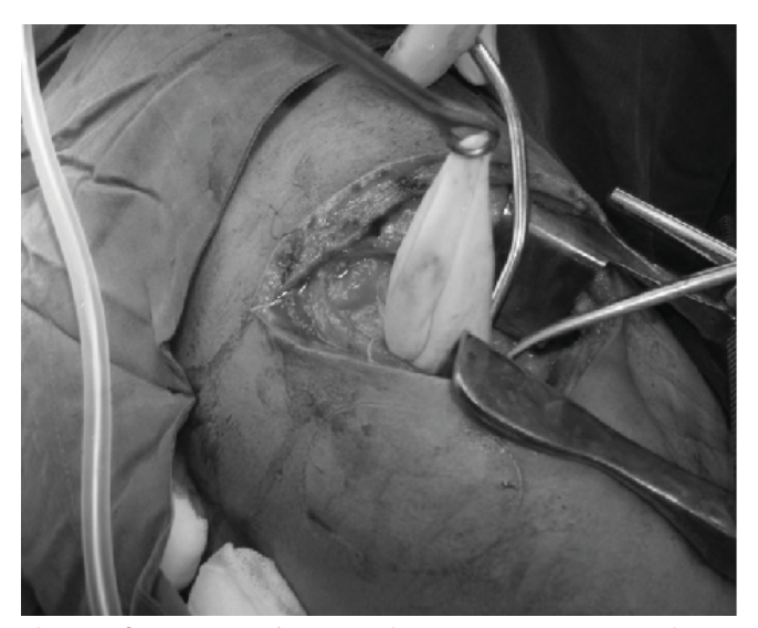
Figure 2. Operative view (resection of the laminating membrane of hydatid cyst of the posterior mediastinum)