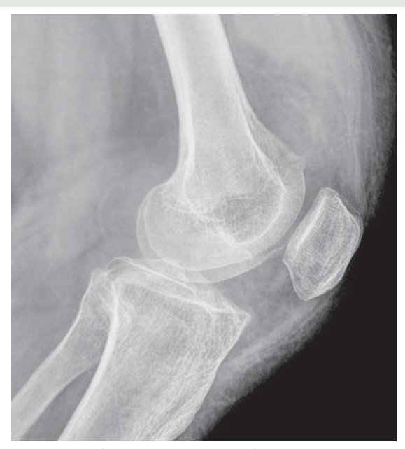
Figure 1. Lateral radiograph of the right knee reveals fullness in the suprapatellar region with predominant fat attenuation