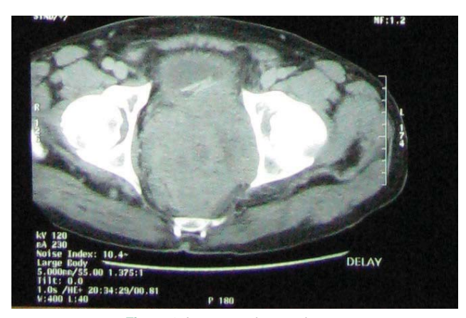
Figure 2. Large rectal tumoral mass

behavior obviously in the course of time.