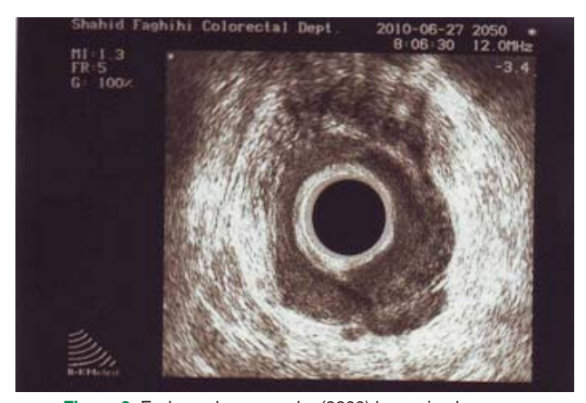
Figure 3. Endo anal sonography (3600) large circular mass

Extrapulmunary small cell carcinoma has the same microscopic, immunochemical, and ultra structural characteristics the same as lung including high potentialfor malignancy. In spite of this, its definite diagnosis is challenging for pathologist because ofdifficultydistinguishing it from lymphoma.<sup>8</sup> Three histological types of small cell carcinoma of colorectal area areincluding:1-diffrenti-