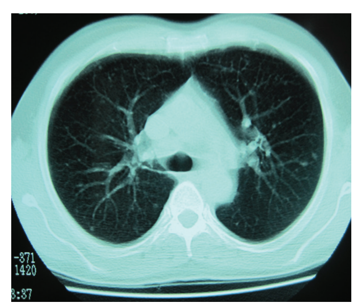
Figure 2. Bilateral multiple nodular pulmonary lesions on chest CT.

Cite this article as: Hedayat Yaghoobi M, Abdiliae Z, Alijani N, Ghaemi O, Dehghan Manshadi SA. Photoclinic. Arch Iran Med. 2014; 17(6): 455 - 456.