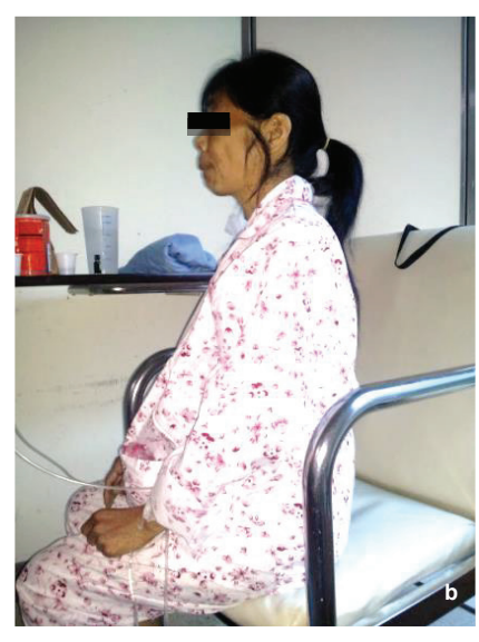
Figure 1. (a) The patient presented to our hospital with a dropped head and could not raise her head actively. (b) The function of the neck extensor significantly improved 2 days after arthrotomy with debridement of the right shoulder.