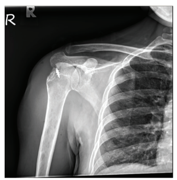
Figure 2. Radiography of right shoulder showed retention of an anchor in the greater tuberosity with adjacent soft tissue swelling.