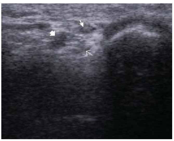
Figure 1. Axial carpal ultrasonogram at the level of guyon tunnel shows ulnar artery (arrowhead), ulnar nerve (thin arrow) and hypoechoic mass in the tunnel (thick arrow).