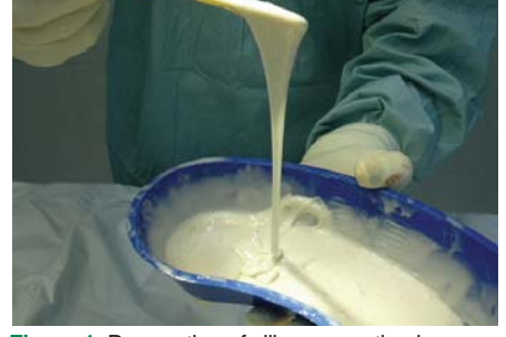
Figure 1. Preparation of silicone prosthesis during surgery by "addition curing" (in-vivo curing)

The thickness of the formed prostheses ranged from 1.5 to 2.4 cm, depending on the anatomical shape of the area. The hardness of the formed prosthesis was about 15 in all the cases and covered the entire anatomical areas including pubic tubercle, internal oblique muscle, deep ring and iliopubic tubercle sufficiently. After the termination of the procedure, there was no excessive silicone in the adjacent area or subcutaneous tissue. Unacceptable bulging in the surgical area after skin closure was, similarly, not