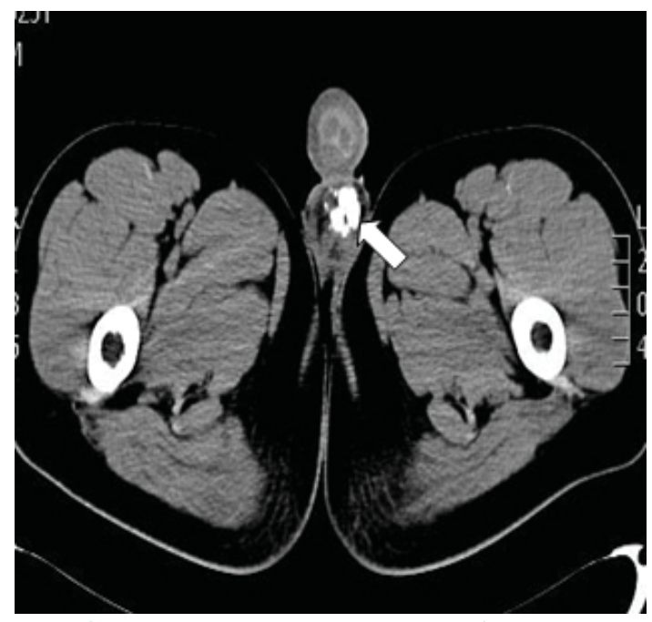
Figure 1. Multiple high densities in the patient's left testicle.