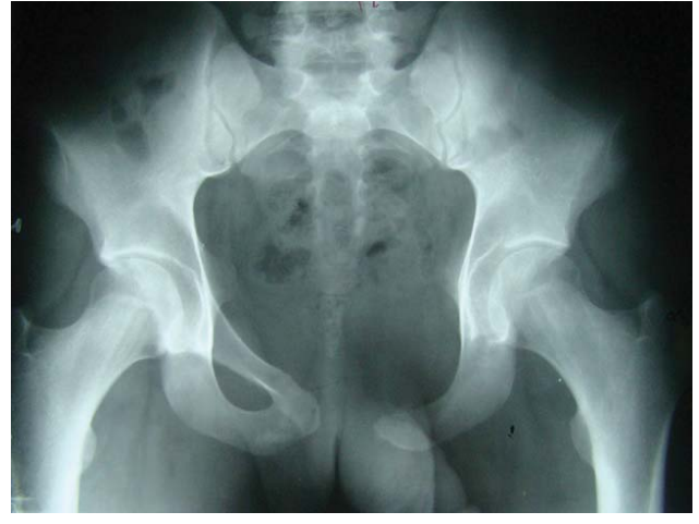
Figure 3. The 3-year post-operative pelvic radiography showing stable pelvic ring (Case 7).

augment the ischium (Figure 2). In case 6 with periacetabular and pubic rami involvement, in addition to extensive curettage of periacetabulum and filling of the void space with cancellous allograft, reconstruction with fibular strut allograft was done after resection of involved pubic rami. The allograft was fresh frozen and taken from the bone bank of our hospital. In patients with periacetabular involvement, we limited weight bearing for the involved side until union and consolidation were seen in plain radiographs.