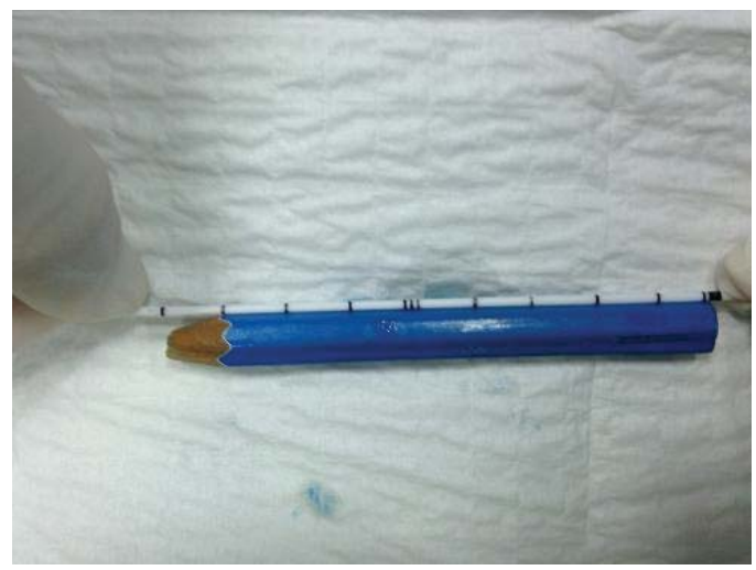
Figure 2. Extracted foreign body (Piece of Pencil)