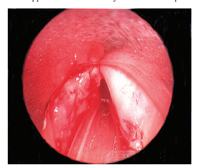
Figure 1. Direct laryngoscopy shows bulging of the tumor on the left vocal cord before biopsy

A direct laryngoscopy was performed which showed a bulging mass and maceration of the left true vocal fold with extension into the subglottic region causing partial obstruction of the airway (Figure 1). No other lesions were found in the oral cavity, oropharynx, or hypopharynx. A biopsy was taken of the glottic lesion and the otolaryngology surgeons proceeded to debulk the remaining tumor. The patient continued with chemotherapy and radiotherapy for MF, and was subsequently discharged from the hospital. After debulking his larynx, he was hospitalized several times for dehydration, urinary tract infections, multiple abscesses, cellulitis, and pneumonia. However; pruritic plaques, nodules, and skin breakdown continued to persist in the patient all of them appeared to be refractory to current therapies.