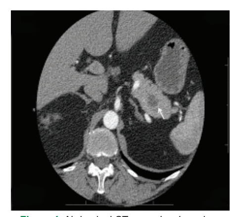
Figure 1. Abdominal CT scan showing a low attenuated cystic lesion in the pancreatic tail (arrow)