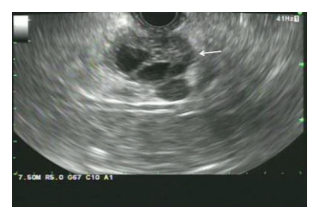
Figure 2. EUS image of the pancreas showing the solid-cystic mass lesion (arrow)

A 56-year-old man was incidentally found to have a 15 mm cystic lesion in the tail of the pancreas on CT scan. Two years later, the patient remained