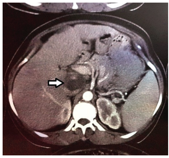
Figure 2. Abdominal Computed Tomography with contrast. The arrow shows the tumoral mass within inferior vena cava.