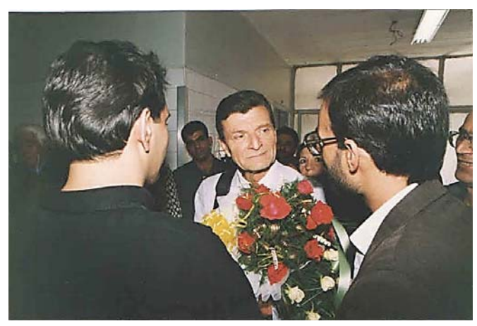
Figure 1. The author's first visit to the Hemophilia Center at the Imam Khomeini Hospital in 1999 (the author is seen in the middle of the photo).