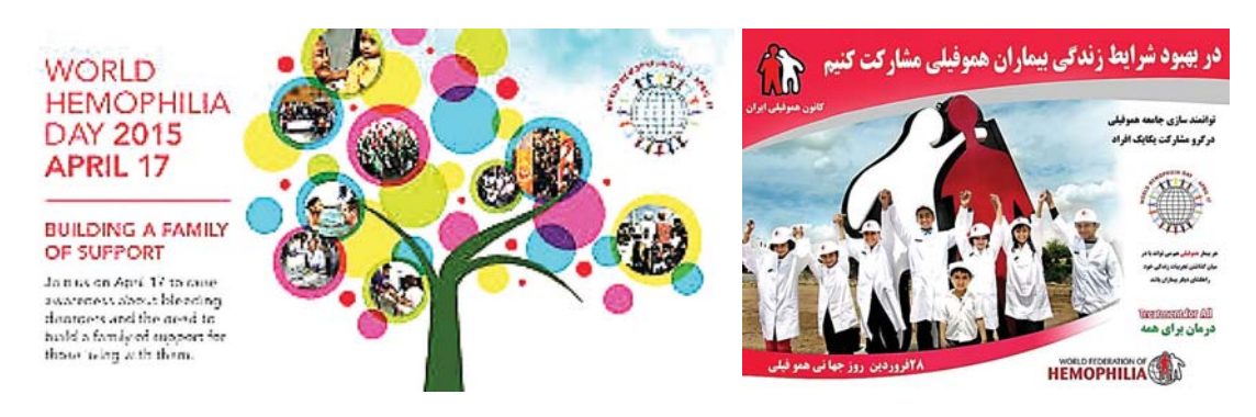
Figure 3. The posters of the World Hemophilia Day April 17/ 28 Farvardin in Iran. (Available from: URL: https://orphandruganaut.wordpress. com/2015/02/15/world-hemophilia-day-2015-april-17/; Available from: URL: http://hemophilia.org.ir/)

demic staff of Tehran University Medical School in 1964, provided sufficient funding for the purchase of all the equipment required to set up a modern clinical hematology laboratory. These included facilities for hemoglobin electrophoresis; radio-isotopic equipment for determining blood volume, Cr^{51} red-cell mass and survival, Vitamin B_{12} absorption, radio-technetium platelet survival; red cell enzyme allotypes such as G6PD and PK; serum folate assay, and so forth.