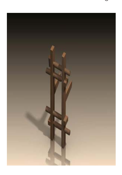
Figure 2. Computer-aided design made by Akın Çömelekoğlu of the wooden vaginal speculum.

Surgery)", the explanation of medical instruments with drawings was used in a way similar to "At Tasrif". Aside from presenting the drawings of medical instruments, Sabuncuoğlu provided miniatures depicting the practices conducted. Sabuncuoğlu is the first author of medicine who explained the medical procedures with drawings. In this context, Cerrâhiyyet'ül-Hâniyye is the first medical textbook depicting how the vaginal speculum is applied on patients.