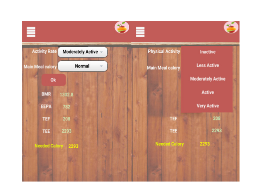
Figure 3. Recording one's Physical Activity and Number of Calories Received From the Main Meal.