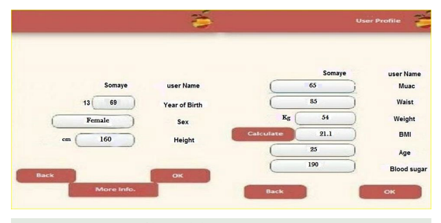
Figure 4. Patient's Profile Module.