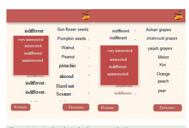
Figure 5. Iranian Snacks in the Recommender System.

weight, birth date, arm and waist circumference, medication regimen and BMI as estimated by the system) in their profiles. Figure 4 shows the view of the user profile.