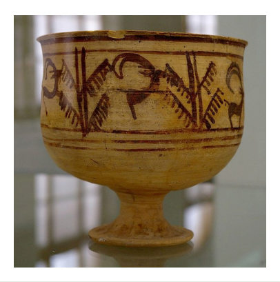
Figure 2 . The First Animation of the World Belongs to the Burnt City.