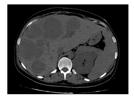
Figure 1 . Abdominal Computed Tomography Demonstrating Multiple Well-Defined Hypervascular and Heterogeneously Enhanced Lesions up to 12.5 \times 8.8 cm Throughout the Liver.

The most important mechanism of NICTH has been attributed to increased glucose utilization and inhibition of glucose production in the liver due to tumoral secretion of incompletely processed IGF-II, the so-called big IGF-II. Furthermore, less common causes include expression of autoantibodies against insulin or its receptors and