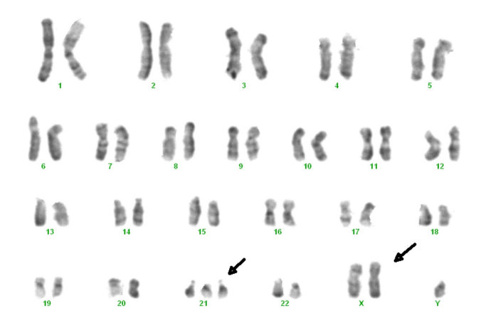
Figure 2. G-Banding Karyotype of the Patient. 48 chromosomes with two extra chromosomes X and 21 in the karyotype of patient.

Published cases of 48,XXY,+21 generally showed typical feature of Down syndrome and the Klinefelter syndrome characteristic feature not apparent until the pubertal