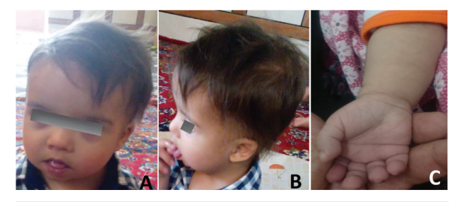
Figure 1. Frontal (A) , Lateral (B) and Palmar (C) Views of the Patient. Face appearance showed low set and small ears, epicanthic folds, protruding tongue, upward sloping palpebral fissures, strabismus (A and B) and simian crease (C) .

and strabismus. There was a load systolic murmur in heart auscultation on mitral and pulmonary focal areas. The genitalia was normal. He showed no other malformation (Figure 1).