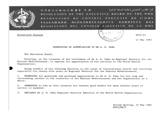
Figure 2. Expression of Appreciation to Dr. Taba during the Seventieth Session of the WHO Meeting in Geneva, 1982.4

He believed that community health, rural development, implementation of primary health care, health workforce development and health education of the general population were the main priorities for the region. Some of the services and health affairs that were implemented in all member countries of the region with Dr. Taba's leadership, support, and supervision are: