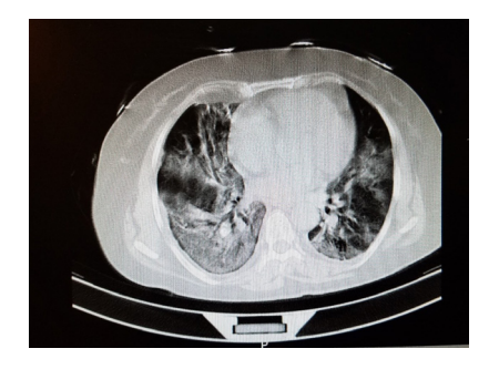
Figure 1. Lung CT Shows Bilateral Diffuse Ground Glass Opacities.

was 3 out of 5 using Medical Research Council (MRC) scale, pinprick sensation was decreased distally, and Deep Tendon Reflexes (DTRs) were absent. An electrodiagnostic test (EMG/NCV) was performed. The EMG/ NCV findings were suggestive of Acute Motor & Sensory Axonal Neuropathy (AMSAN), a rare axonal variant of Guillain-Barré syndrome.<sup>11</sup> Compound motor action potentials (CMAPs) and sensory nerve action potentials in the studied nerves were diminished or absent and no late response was seen, supporting the AMSAN variant of GBS (Tables 1 and 2). The cerebrospinal fluid (CSF) was also obtained and analyzed which was unremarkable with glucose: 78 mg/dL, protein: 48,4 mg/dL (normal value: under 50 mg/dL), and no white blood cells (WBCs). No