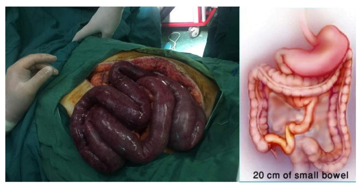
Figure 2 . A 37-year-old man who had developed portal vein thrombosis post-splenectomy and nearly total small bowel resection, referred to our center. The patient was hospitalized in the IRU and was on PN for 2 months. Work-up and surgical exploration showed 5 cm of proximal jejunum and 15 cm of distal ileum including ICV and full length of the colon. Primary anastomosis was done following which the patient was on PN for 1-month post-surgery. The patient was then weaned off PN and discharged in good conditions and with regular follow-up.