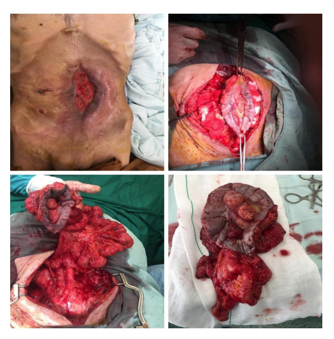
Figure 3. A 60-year-old man who had undergone colon surgery for colon cancer and had multiple operations due to fistula formation, referred to us with a picture of island of fistulas. The patients underwent exploration en-bloc resection of the fistula complex with remnants of total small bowel length of 150 cm; moreover, end-ileostomy was performed. The patient came off PN and is in good conditions.

With regard to our results, the most common indication