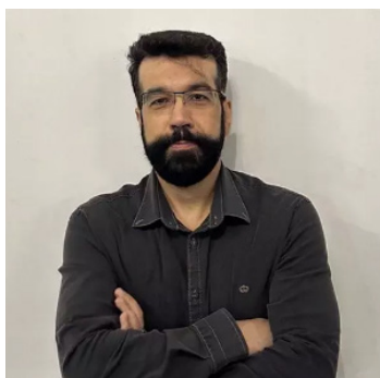
Figure 1. Dr. Masoud Davoodi, a cardiologist in the city of Yasuj, was murdered by the brother of a deceased patient

professionals from violence, accompanied by calls for stricter enforcement. Second, the portrayal of the medical community in a misleading and unrealistic manner, particularly by the media. While such concerns are understandable, especially regarding the role of the media, other underlying factors are less noticed.